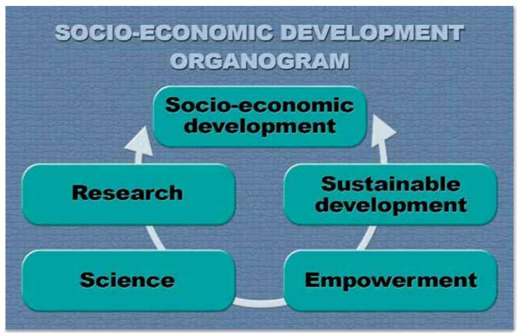
Figure 1: Socio-economic Development Organogram

be used to improve interest in science are through outreach efforts, such as workshops, seminars, and creating awards and scholarships.