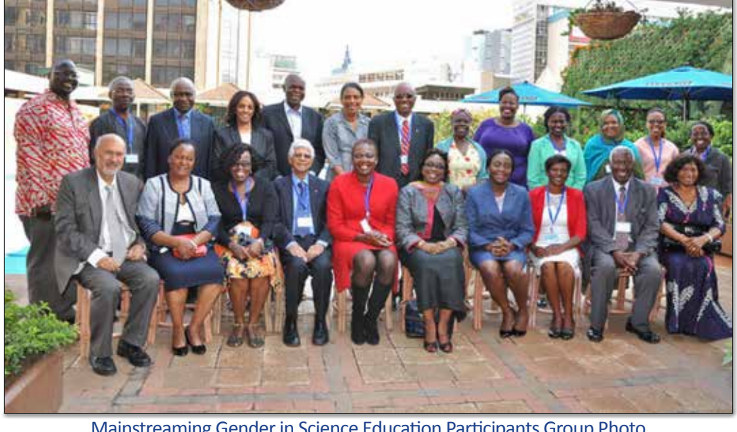
Mainstreaming Gender in Science Education Participants Group Photo