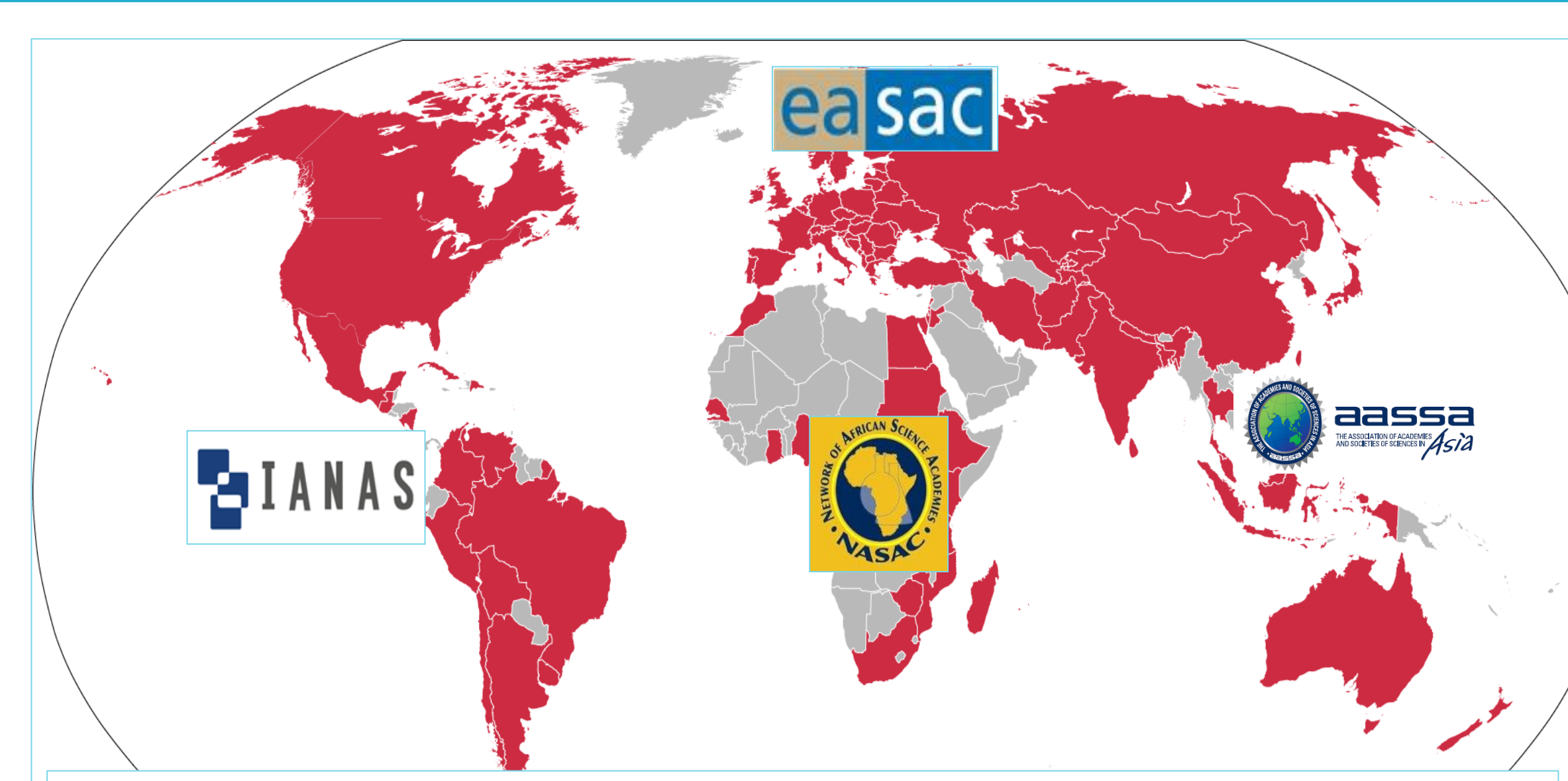
IAP members (in red) and IAP regional networks for the Americas, Europe, Africa and Asia/Pacific

IAP - the global network of science academies, includes 111 national and regional science academies as members. The expertise present in these member academies, and their reputation both in their own countries and internationally, means that IAP is considered as a credible source of up-to-date, peer reviewed and unbiased science advice. Since its establishment in 1993, IAP and its members have worked on a number of issues at the science-policy interface, including disaster risk reduction.